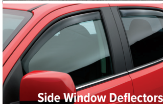
Side Window Deflectors