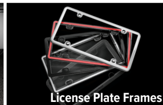
License Plate Frames