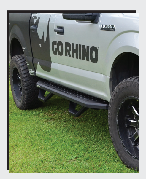
$50 eRewards RB20 Running Boards with drop steps