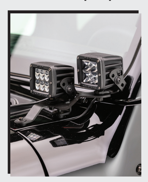
$10 eRewards JL Light Mounts