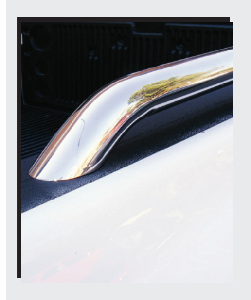
$25 eRewards Universal Bed Rails