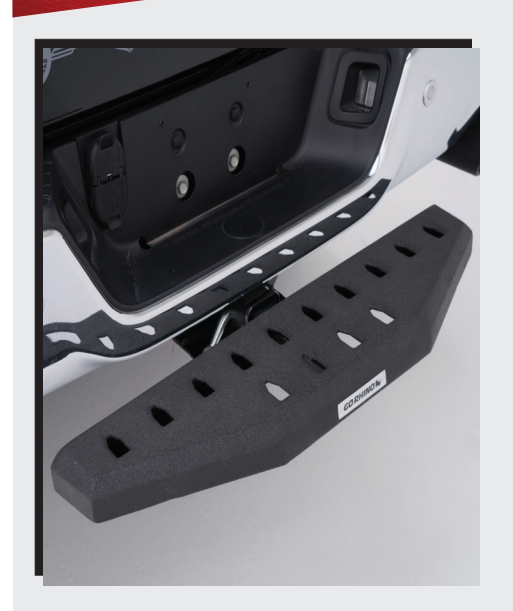
$25 eRewards Hitch Steps