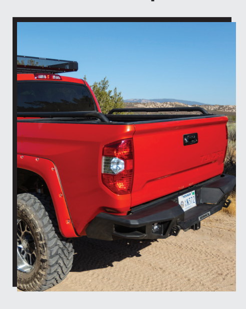
$25 eRewards Stake Pocket Bed Rails