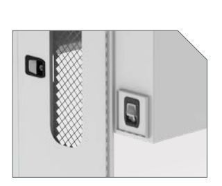
REAR ACCESS DOOR