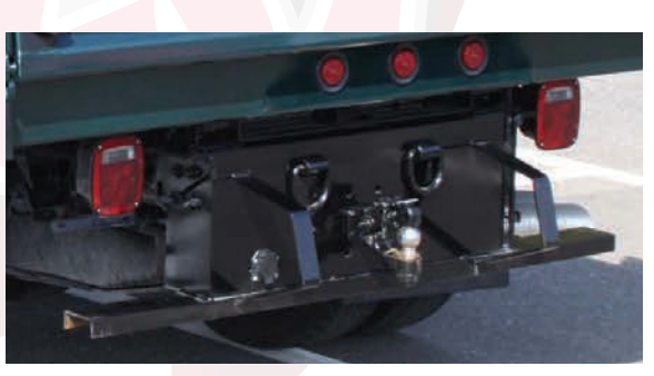
Pintle and Receiver Hitch Plates