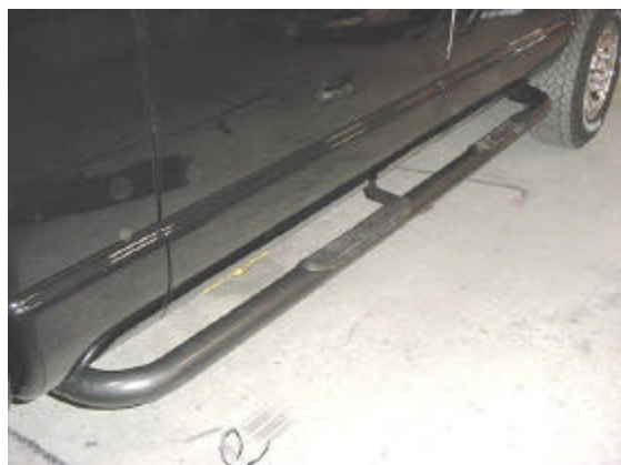
SIDE BAR INSTALLED. DRIVER SIDE PICTURE