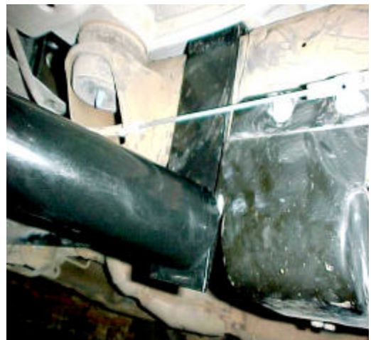
Front bracket installed, driver side.