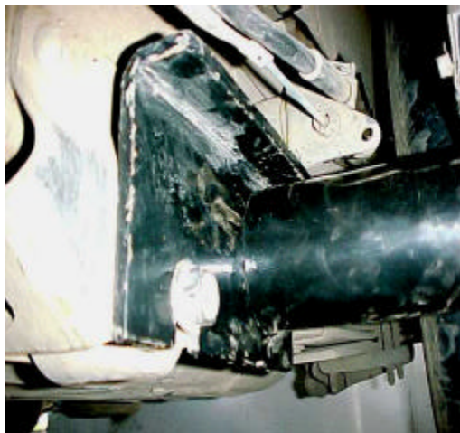
Rear bracket installed, driver side.