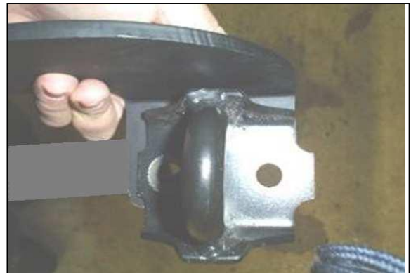
Bracket and tow hook. Passenger side.